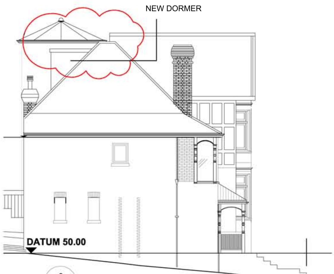
3 West elevation - scale 1:100 P202